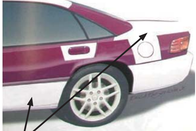
Protective Tape for Painted Metals, Plastic Surfaces and Automotive Clearcoat Paint Finishes