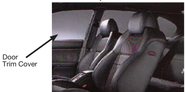
Door Trim Cover